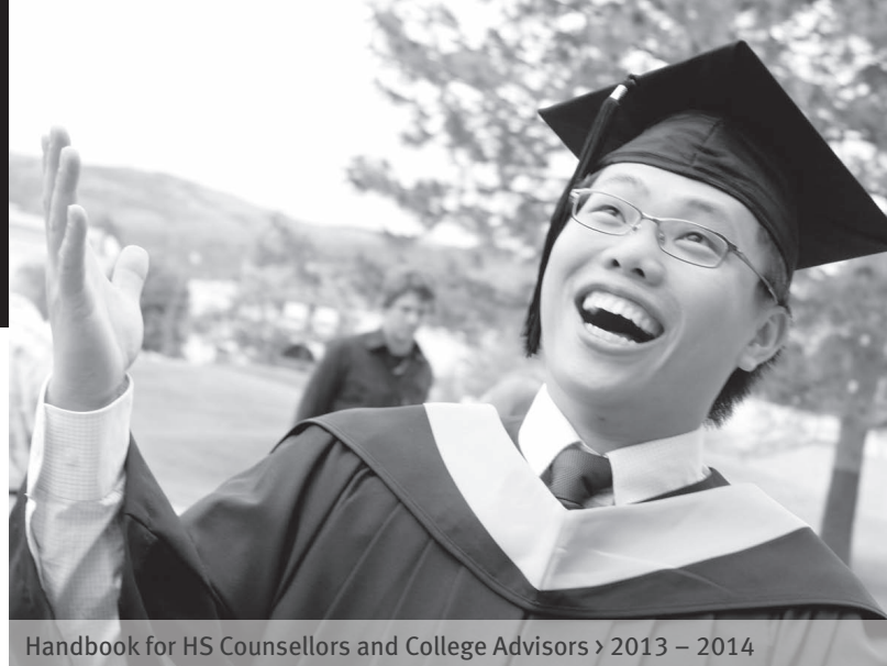
Handbook for HS Counsellors and College Advisors > 2013 – 2014